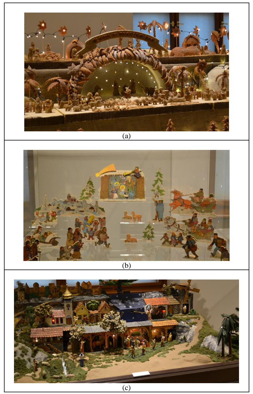
Figure 1. (a) Nativity Scene made of bread, constructed by the students of the Technical College of Commerce, Services and Entrepreneurship in České Budějovice; (b) Lada's Czech Nativity Scene (paper, plywood), 1<sup>st</sup> issue in 1919; (c) Movable Nativity Scene from the middle 1950s (home-made) (Place: Chrismas exhibition 'The Beauty of Nativity Scenes', Museum of South Bohemia in České Budějovice, 2016).